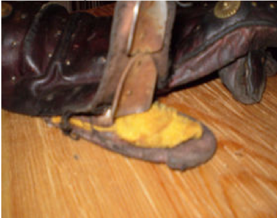
(The thumb of the glove showing the yellow felt lining between the gloves)