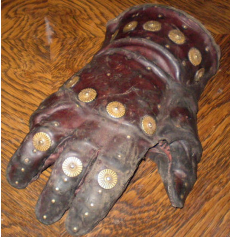
(The finished glove, a little beaten up and dirty after some seasons on the battlefeild)